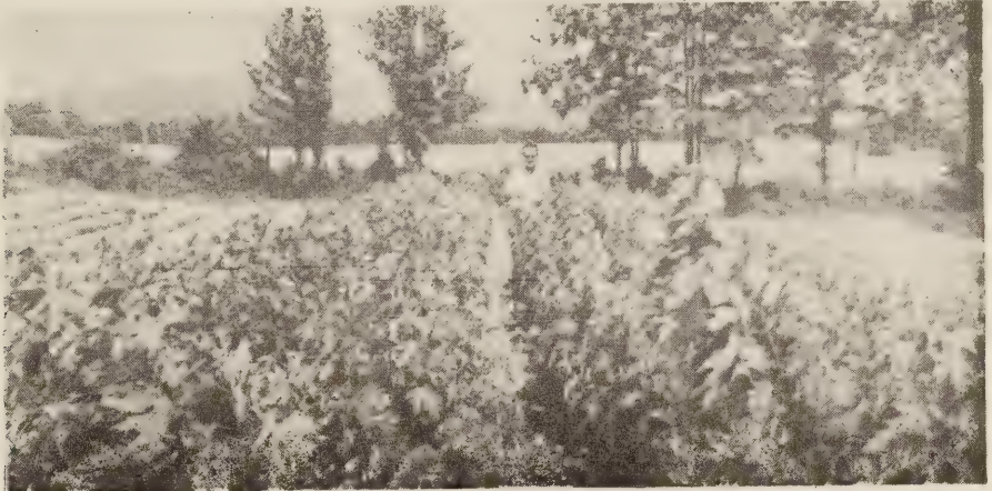
Block of McGee's two year Silver Maple Seedlings.

Practically all the trees you order, except smaller liners are dug to your order. Sometimes during the rush season we are unable to get the extra help to dig stock same day your order is received. So, won't you please help us to help you by sending your order in advance of shipping date as far as possible? We want to give you good freshly dug stock when you want it.